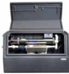
Whole House UV System