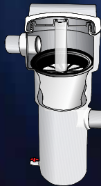
Pre-Tank Aqua Filter

First flush water diverters capture the first and most contaminated rainwater from the roof & gutters, automatically diverting the subsequent cleaner rainwater to the water tank. A critical component for every rainwater harvesting system