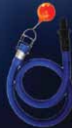
Floating Foot Valve

A simple yet very effective way of filtering rainwater before it gets into your tank. Removes most solids and reduces sediment and organic material