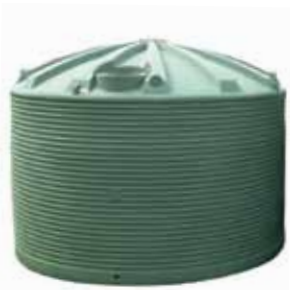
25,000 Litre Water Tank