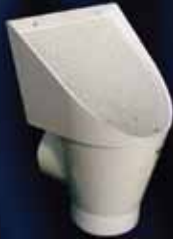
Leaf & First Flush Diverters

We have a wide range of rainwater accessories to complement and enhance any rainwater system.