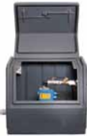
Whole House Pump Box